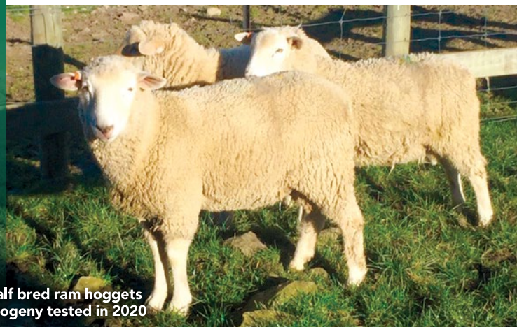
Half bred ram hoggets progeny tested in 2020